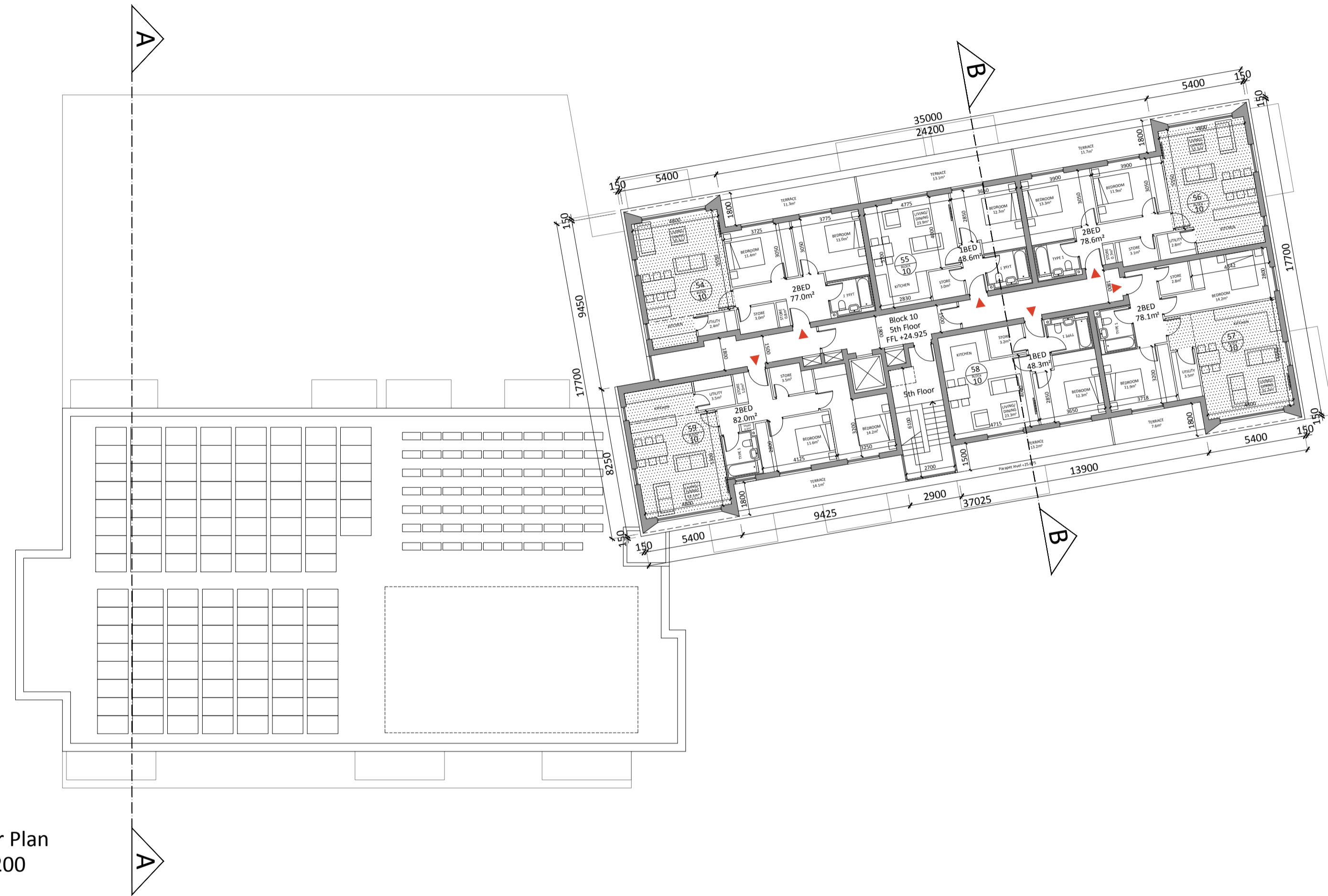
Block 10 5th Floor Plan Scale 1:200